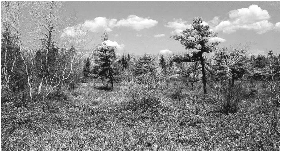
Fig. 1. Pocono mesic till barrens, northeastern Pennsylvania. Dominant shrubs are sheep-laurel ( K. angustifolia ), common lowbush blueberry ( V. angustifolium ), rhodora ( R. canadense ), and scrub oak ( Q. ilicifolia ). Other abundant woody species include black chokeberry ( Aronia melanocarpa ), gray birch ( B. populifolia ), teaberry ( Gaultheria procumbens ), black huckleberry ( Gaylussacia baccata ), pitch pine ( P. rigida ), swamp dewberry ( Rubus hispidus ), other lowbush blueberries ( V. myrtilloides , V. pallidum ), and witherod ( Viburnum cassinoides ).

The shrublands of the southern Pocono Plateau may have gone the way of many others in the northeastern United States and succeeded to forest if it were not for